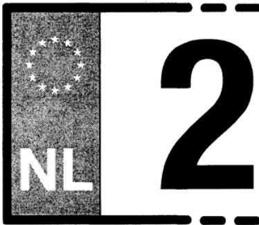
MODEL 1 (example)