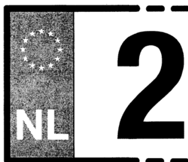
MODEL 1 (example)